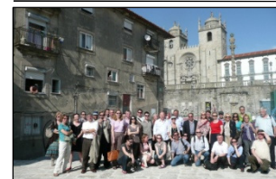
Shrinking violets in Porto