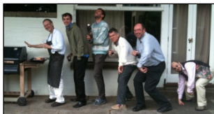
Evolutionary mnemonic: Many Very Early Men Ate Juicy Steaks Using No Plates