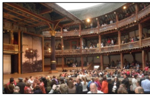
This Wooden O Dear: A long night on hard benches