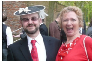
On this, the day of my Goddaughter's wedding, you offer me da no respect...