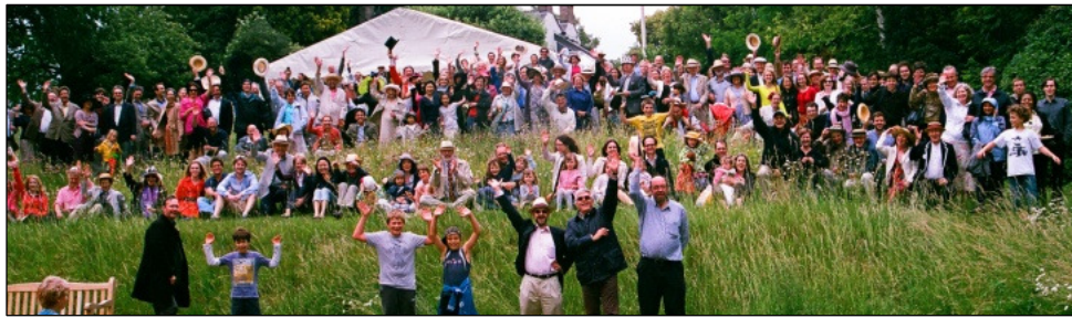
The hatted hordes of the Bumps party guests occupy the grassy banks of Ditton Corner. Were you there? Can you spot yourself?