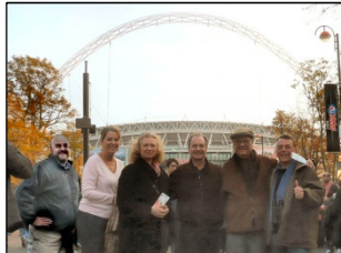
Arch friends: the other kind of football at Wembley

Strongly recommended: A night punt with a wildlife expert and a special detector that makes audible the social chatter of swooping bats. Fascinating!