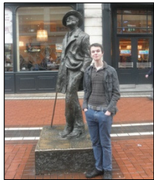
Joyce and aesthete