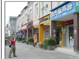
Duijiangyan 2011, completely rebuilt