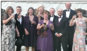
Mixed doubles II: Black tie break at Whittlesford