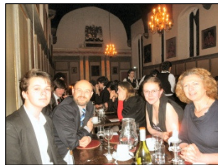
Jesus feeds the five thousand