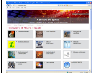
Research website: http://www.risk.ibs.cam.ac.uk/

The Centre for Risk Studies at Cambridge University finally began its research programme, after several years of fundraising and community building. Its annual meeting is fast becoming an industry event. The research agenda includes a new approach to systemic shocks.