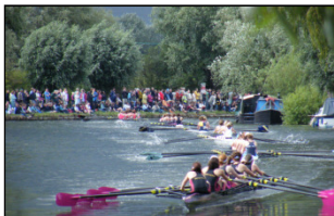
Thunderous skies loomed over the rowing action