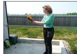
What seems to be the problem?