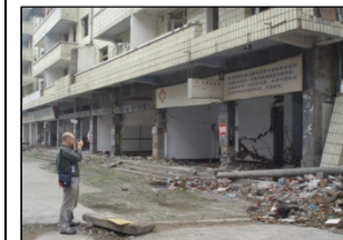
Duijiangyan 2008, ruined by the earthquake