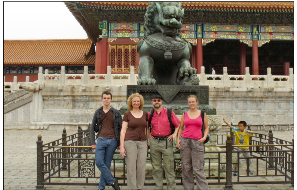
Gang of Four in the Forbidden Palace