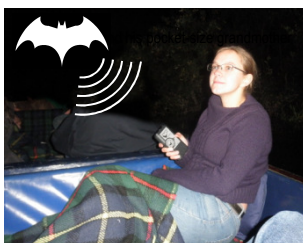
Bat Girl and her detector. Pipistrelles on 90 kHz