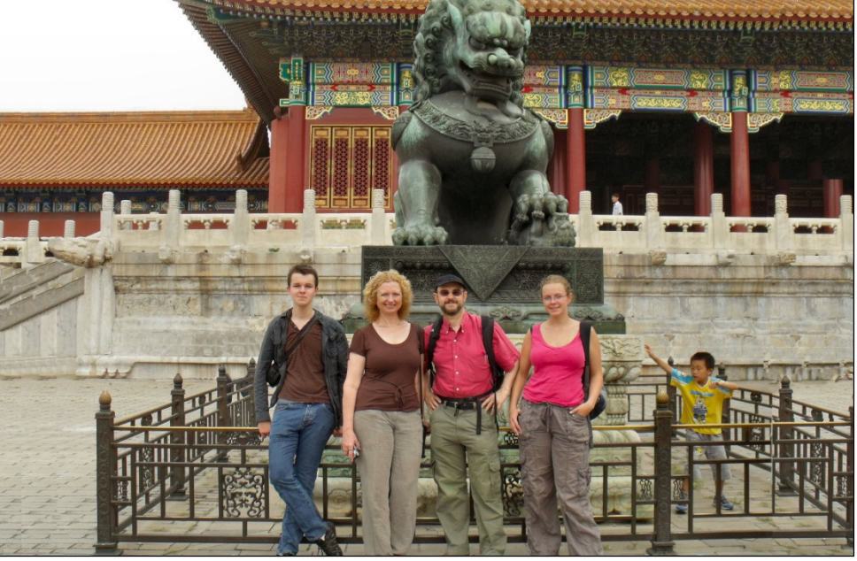
Gang of Four in the Forbidden Palace