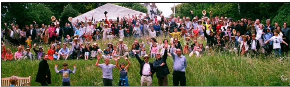
The hatted hordes of the Bumps party guests occupy the grassy banks of Ditton Corner. Were you there? Can you spot yourself?