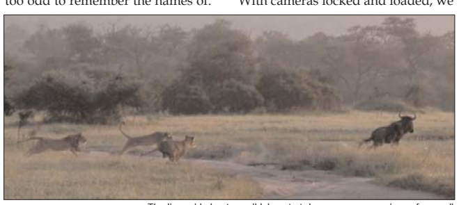
The lion pride hunts a wildebeest at dawn - a gnu experience for us all