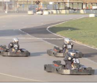
Boys with their toys